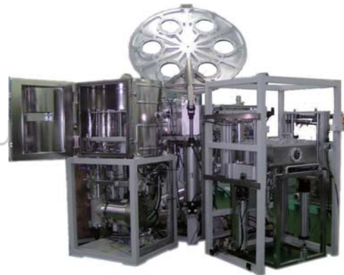
Cluster Transfer System for Flexible Substrate Coating