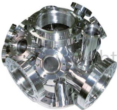
Institutions for academic research UHV Chamber