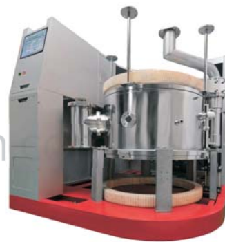
Cutting Tool PVD Coating System