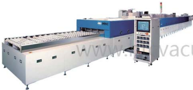
Thin Film Solar Cell Sputtering PVD System