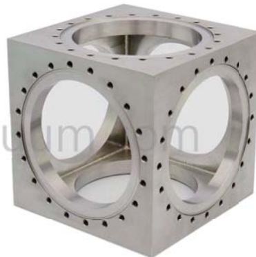
Standardized design UHV Chamber