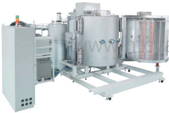
Vacuum Evaporation and Polymerization System